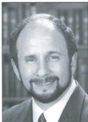
Hon. Paul Wellstone

Hon. Paul Wellstone went from teaching political science at Carlton College in Northfield, MN, to the floor of the United States Senate after becoming the only challenger to unseat an incumbent in the 1990 Senate elections. Well known for his grassroots organization and for his progressive policies, Senator Wellstone helped lead the fight to ensure that parents could take time from work to care for sick children and aging parents. He also introduced legislation to provide $65 million to support supervised visitation programs. Senator Wellstone is an outspoken advocate of the Violence Against Women Act and is supporting legislation to enable public school personnel to work with children who witness domestic violence.